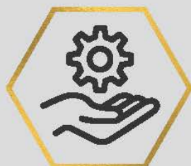
Station Service, Oil Truck Repair and Calibration