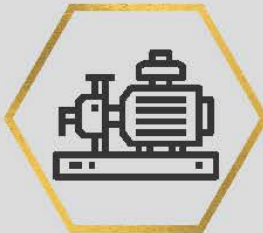
Fluid Handling Equipment