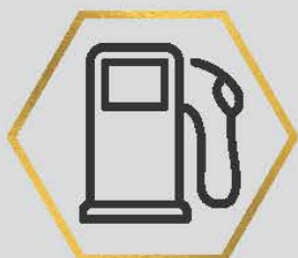
C-store Solutions and Equipment