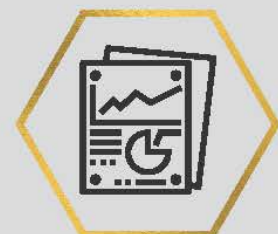
Fuel Management Systems